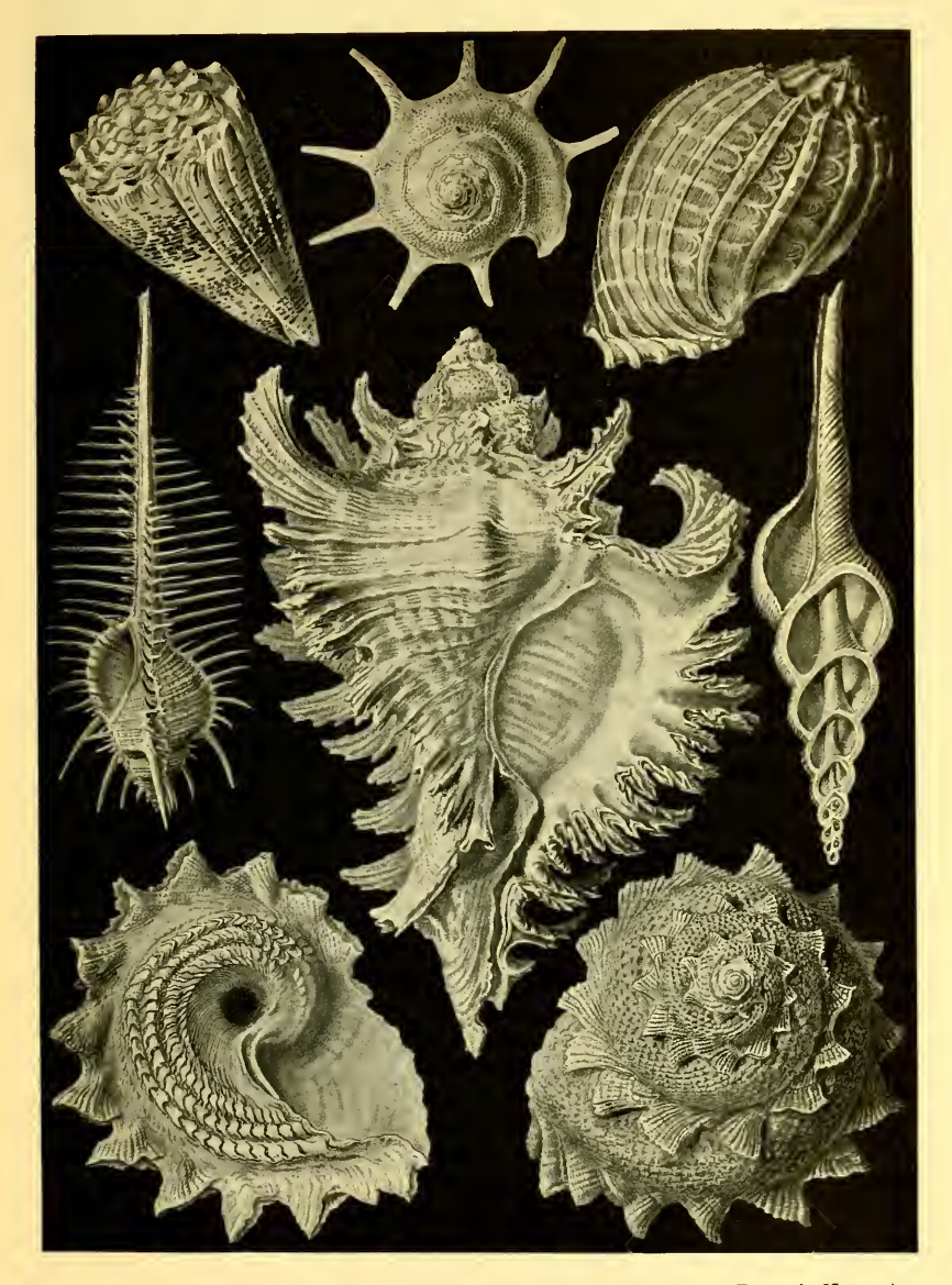
POSOBRANCHIA. Specimens of beautiful snail-shells. (Haeckel's Artistic Forms in Nature.)

hidden beauty. He has not only contributed his share toward deciphering the riddles of the universe, but he has also a keen appreciation of the wondrous beauty