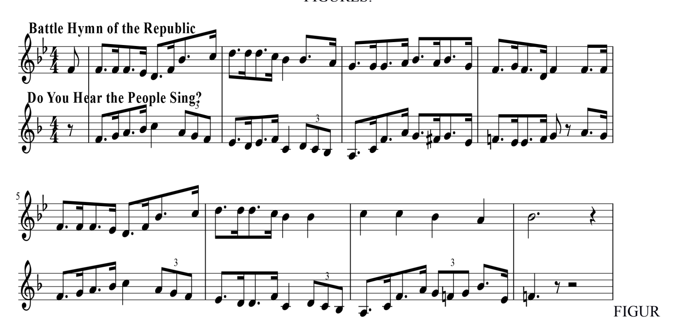
E 1: Battle Hymn of the Republic and Do You Hear The People Sing? Rhythm Comparison. (Ward Howe, Schönberg)