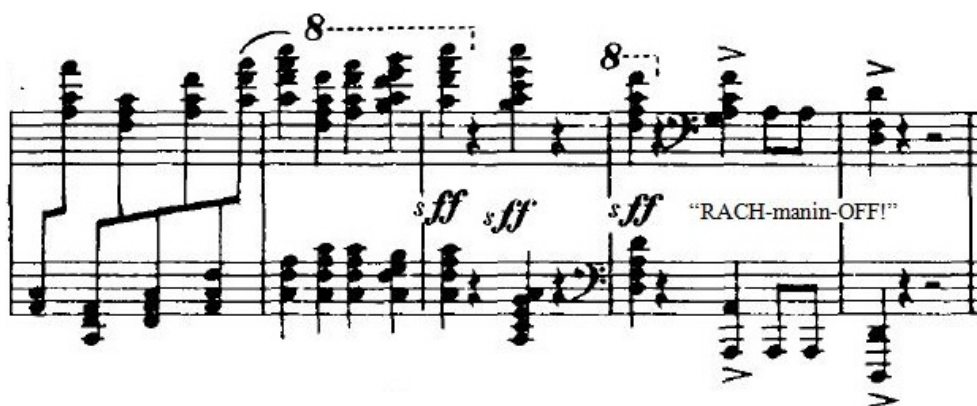
Figure 2.3. Rachmaninoff, Piano Concerto No. 3, signature "RACH-manin-OFF!"

The third movement of the concerto is broadly structured into three sections. In the first, the strings are featured in a sharp rhythmic motive, coupled with an expansive lyrical theme. Returning again to the primary theme of the first movement, a large middle section is itself structured in three parts, the middle being a very slow and expressive with a brilliant scherzando both before and after. With a return of the first section of this movement, the orchestra and soloist modulate from D-minor to D-major, for an ending which is at once both dark and exalted.