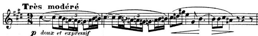
Figure 1.1. Debussy, Prélude à 'L'Après-midi d'un faune , principal theme

The Prelude begins with an ambiguous chromatic theme in the flute, the very instrument associated with the faun.