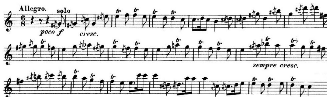
Figure 3.6. Berlioz, Symphonie Fantastique , idée fixe in mvt 5.

With a diminished seventh chord in hushed tremolo across the violins and violas, the final movement begins in the afterlife. The idée fixe takes its final form as the beloved, now transformed into a witch, exacts her revenge on the artist: