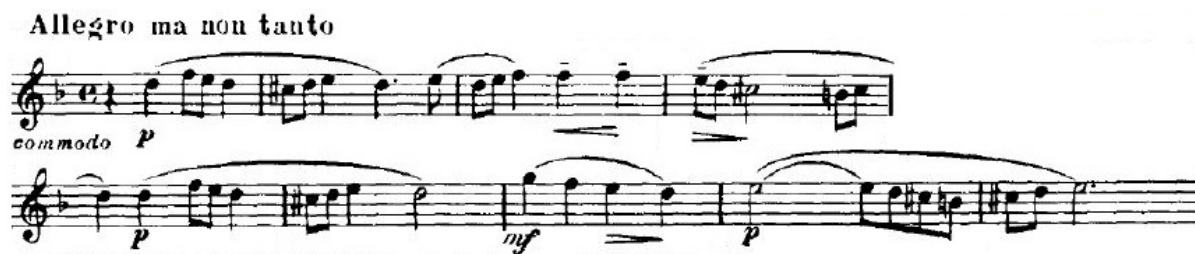
Figure 2.1. Rachmaninoff, Piano Concerto No. 3, principal theme of first movement.

From its principal statement, this theme develops into ever increasing virtuosic complexity, eventually yielding as a second theme gently passes between orchestra and soloist. After a return of the principal theme, an extended development includes multiple climaxes and two solo cadenzas for the pianist. Rachmaninoff actually composed two separate cadenzas for the second, longer solo section in this development. While the first, and most often performed of which, is more chordal and lyrical, Rachmaninoff himself performed the work with his second more rhythmic cadenza 7 . A brief and graceful cadence in the horns returns us to the music of the opening, and thus to a brief coda concluding the movement.