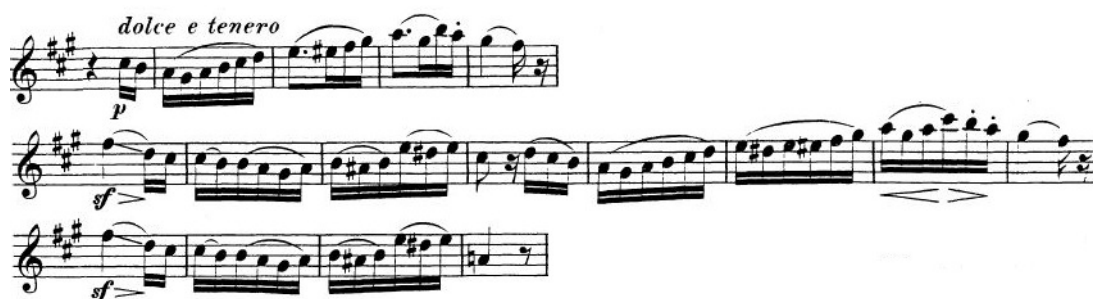
Figure 3.3. Berlioz, Symphonie Fantastique , idée fixe in mvt 2.

In the second movement, introduced by florid solos on harps (Berlioz called for as many as six 11 ), our artist finds himself ever out of reach of his beloved as she twirls from one suitor to the next, as she (our idée fixe ) now takes the form of a waltz: