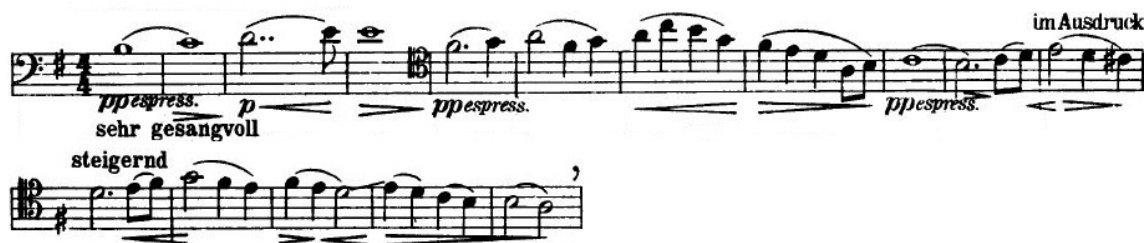
Figure 4.5. Mahler, Symphony No. 4, principal theme of mvt 3.

What follows is a series of affecting variations, eventually leading to the greatest emotional climax of the work. Finally, strings carry us gently upward, towards our first vision of heaven.