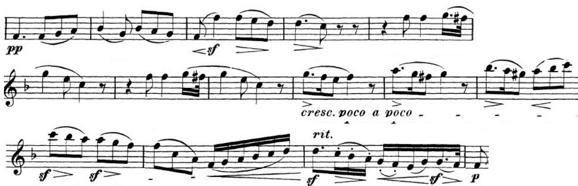
Figure 3.4. Berlioz, Symphonie Fantastique , idée fixe in mvt 3.

As the tale unfolds, the artist experiences jealousy and rage as his hallucinogenic dreams reveal visions of his beloved in the loving arms of another. Finally, as the movement comes to a seemingly quiet close, we once again hear a shepherd's call. But now the call is only returned by the thunder of four timpani, foreshadowing what is to come in the final two movements.