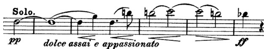
Figure 3.5. Berlioz, Symphonie Fantastique , idée fixe in mvt 4.

The artist, believing he has killed his love in a jealous rage, is now marched to his death, accompanied by a quartet of bassoons and thundering brass. We hear the crowds cheering a relentless drive to the artist's final moments of life when clarinet cries out the idée fixe , a desperate last call to his beloved: