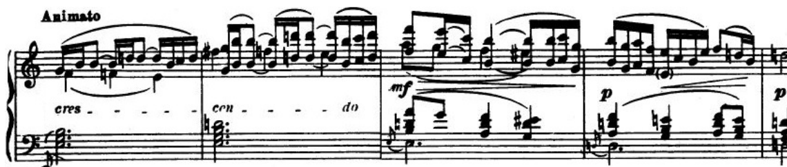
Figure 1.2. Debussy, Prélude à 'L'Après-midi d'un faune , secondary theme

The entrance of the orchestra creates a sense of spaciousness which pervades the piece, suggesting a serene landscape across which the music floats, seeming to grow out of itself. A more rapid variant of the theme appears, twisting and turning as if taken by a sudden breeze. A second theme, longing in character, is passed from strings to winds to solo violin,