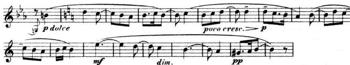
Figure 2.2. Rachmaninoff, Piano Concerto No. 3, mvt 2, variation of principal theme from mvt 1.

The second movement opens with an extended, lushly voiced theme for the orchestra. Leading to a climax only to give way almost immediately to a secondary theme in the solo piano, this romantic melody is treated to multiple variations. With a sudden, albeit subtle, change of character, the primary theme from the first movement reappears in the guise of a clarinet scherzando passage in triple-meter: