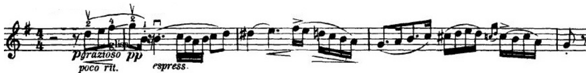
Figure 4.2. Mahler, Symphony No. 4, primary theme of mvt 1.

This introductory motive will serve as a point of reference throughout the first and final movements of the work. In this first utterance, the motive coyly resolves almost immediately into a Schubertian primary theme in G-major.