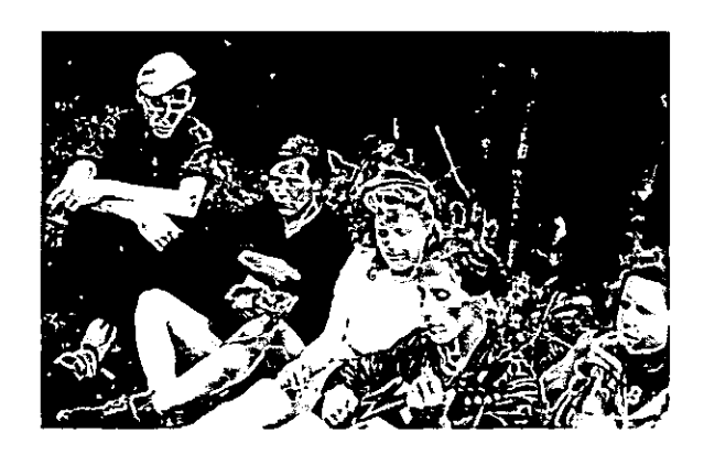
The Edelweiss Pirates (Wikepedia - The Edelweiss, 1)