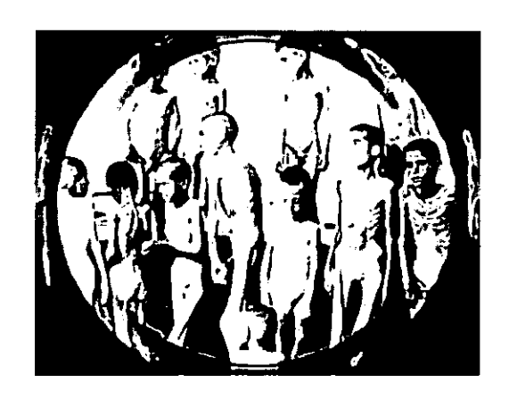
Mengele's Children (Auschwitz, 1)