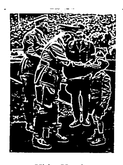
Hitler Youth (Adolf Hitler, 1)