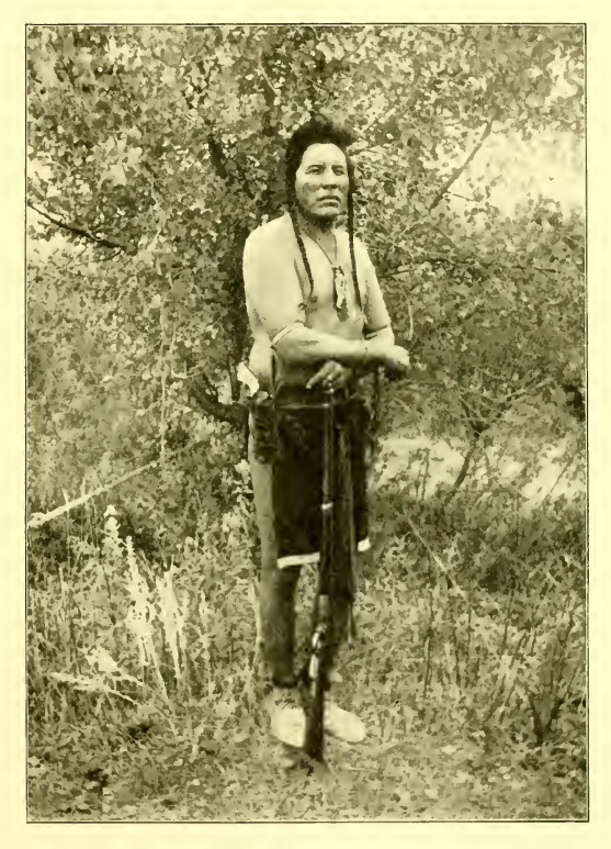
Curley, Custer's Scout (Crow). Only Survivor of the Custer Massacre, June 25, 1876.

dians agreed with this theory, but claimed it had belonged to one of the giants which inhabited the earth many generations back. One of the medicine-men present thus explained the prodigious size of this apparently human bone. "A long time ago," said he, "the great earth was peopled by warriors of gigantic stature. These