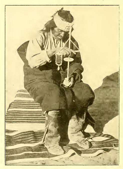
AN AMERICAN INDIAN IGNITING WOOD BY MEANS OF A FIRE-DRILL.

rain to come. It poured so continuously that all the rivers over-flowed their banks, and the prairies became submerged. The Indians in terror fled to the hills and then the waters rose upon them there. At last they climbed the highest peaks of the Rockies, but go where they would the Great Father's vengeance followed them and engulfed them all. Then the earth became silent, and when the last of the waters had receded and all was dry and fair again,