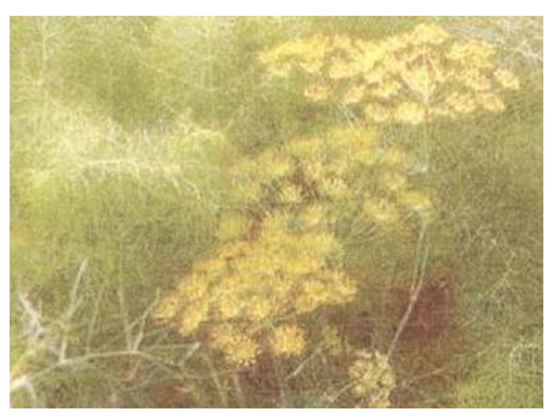
Foeniculum vulgare in the flowering season

Furthermore all chemicals used in this study were analytical grade (Sigma and Merck ) and were imported from abroad.