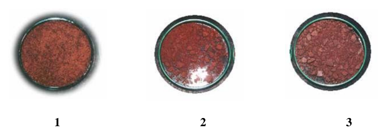
Figure 1. Phytohormones (Saponin) extracted from seed of Foeniculum Vulgare.

proteins, amino acid and fats were present in these samples. The leaves contained higher concentration of flavonoids and fat. Whereas the level of saponins, protein, amino acids and other organic compounds were high in seeds. (Tables 1-6 and Figs 1-2). The seeds of Foeniculum are considered as essential ingredients for many local medicines those can used against stomach, kidney and liver infection and disorders. (Etherton, 2002: Matin et al. 2002). The organic compounds obtained from seeds will further increase the market values of these valuable medicinal plants. The younger and fresh leaves are consider as delicious and traditional vegetables in many areas of this region (Karnick,1998). Furthermore Seeds (fruits) are being use in all most all of houses of this region for many purposes of human population, whereas leaves are mostly used as vegetables either cooked or in the form of salad. (Zaidi,1998)