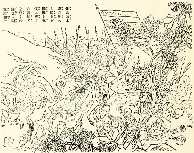
CHINESE IMPERIAL TROOPS PURSUING AND SLAYING BOXERS.

foreigners and all things foreign from China and the restoration of the Empire to its former position of exclusion and self-sufficiency. Its animus is peculiarly strong against foreign religions, not only because the missionary pervades the whole interior of the country, nor yet because his converts are now, for the first time, becoming a body respectable by its numbers and thoroughly imbued with sentiments earnestly desirous of foreign intercourse and innovation, but also because its leaders, by a true instinct, divine that religion is the great transforming force which, once permitted to permeate