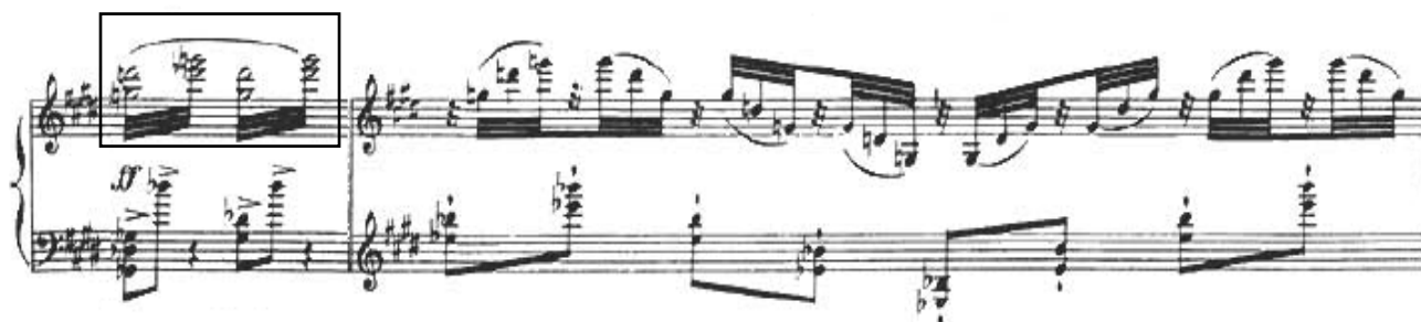
Figure 8: Jeux d'eau , tremolo followed by arpeggios, mm. 26-27

In the first tremolo of Jeux d'eau , the two hands cross each other and then continue crossing through a series of ascending and descending arpeggios. It creates the image of swirling and spattering water (See Figure 8).