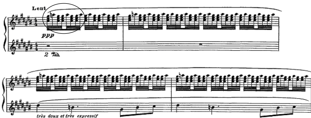
Figure 7: Ondine , trembling accompanying figure, mm. 1-3

In the first tremolo of Jeux d'eau , the two hands cross each other and then continue crossing through a series of ascending and descending arpeggios. It creates the image of swirling and spattering water (See Figure 8).