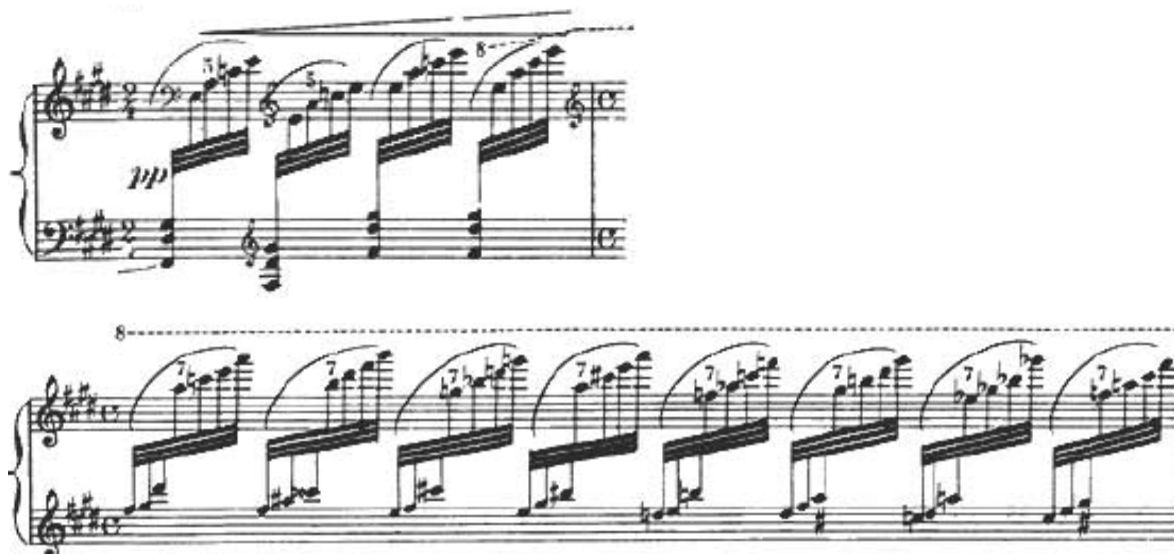
Figure 5: Arpeggio comprised of quintuplet and septuplet, mm. 67-68

These rhythmic and harmonic arpeggios, which contain diverse tuplets and bass chords, imitate the murmuring of a brook through their irregular numbers of five and seven. Groupings of four or eight would not show the flexible nature of water. In addition, a long arpeggio played over more than two octaves expresses not only running water, but it also allows Ravel to expand the range of the piano.