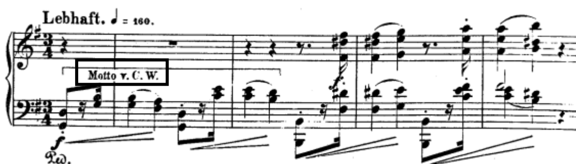
Figure 17: Schumann 'Davidsbündlertänze' Op. 6, 1st Mvmt. Mm. 1-4

There is another influence by Clara in 'Davidsbündlertänze'. According to Daverio, Schumann enciphers Clara's name in the piece, and it is expressed as the pitch configuration of B-A # -B-C # -D in several of the movements: numbers 5, 6, 7, 11, and 13. 9 The pitch configuration of 'B-A # -B-C # -D' is derived from its backwards order of 'D-C # -B-A # -B'. In order to get Clara's name, we can transpose it down a step 'C-B-A-G # -A', eliminate the second and fourth letters: 'C-A-A', and replace 'L' and 'R'. The eleventh movement opens with the configuration of B-A # -B-C # -D (See Figure 18), and several other movements have this figuration in the middle of the movement.