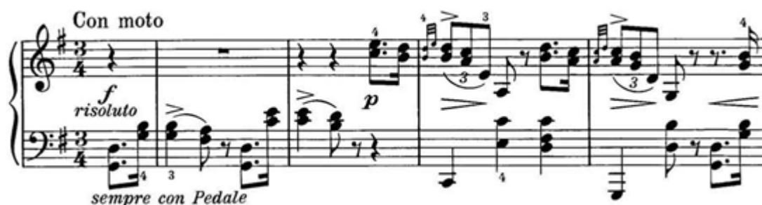
Figure 16: Clara Wieck <Soirées Musicales, Op. 6, No. 5, Mazurka> mm. 1-4