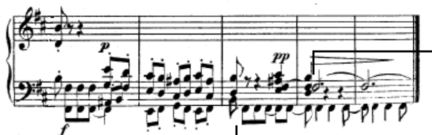
Figure 13: The 16th Mvmt. Mm. 37-41, the F-sharp pedal point of B minor