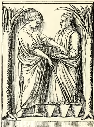
CHRIST WITH THE WAND.