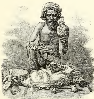
THE SINGALESE CONJURER BEN-KI-BEY. (After Carl Willmann.)

The accounts of travellers are as a rule full of extravagant praise of the accomplishments of foreign magicians; thus, the feats