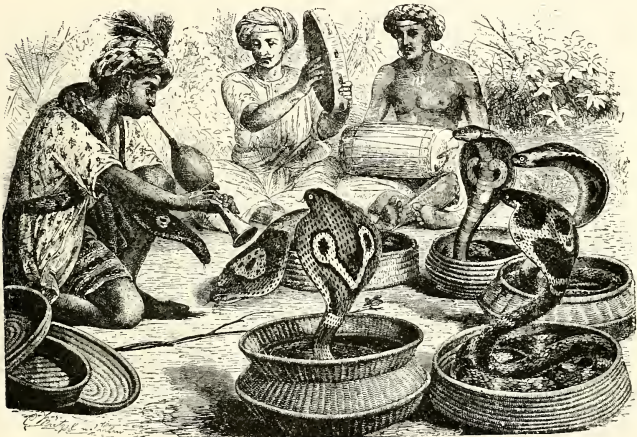
MODERN SNAKE CHARMERS. (From Brehm.)

Exorcism is first replaced by prayer, and prayer together with other religious exercises (such as fasts, ecstasies, trances, visions, asceticism, with its various modes of self-mortification) are practised for the purpose of attaining supernatural powers. A higher religion is not attained until the sphere of religion is discovered in