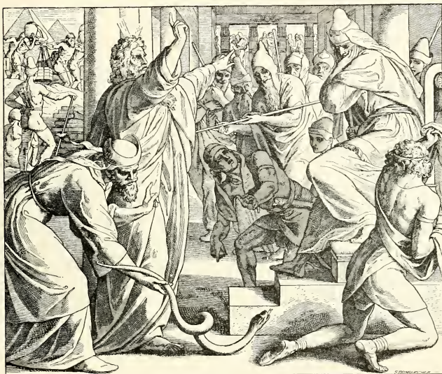
MOSES AND AARON PERFORMING THE MIRACLE OF THE SERPENTS BEFORE PHARAOH (After Schnorr von Carolsfeld.)

Magic originally means priestcraft, being that which characterises the Magi, the Iranian priests. It is probable that the word