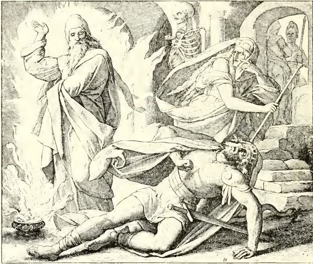
SAUL AND THE WITCH OF ENDOR. (After Schnorr von Carolsfeld.)

The old magic found a rival in science and has in all its aspects, in religion as well as in occultism, in mysticism and obscu-