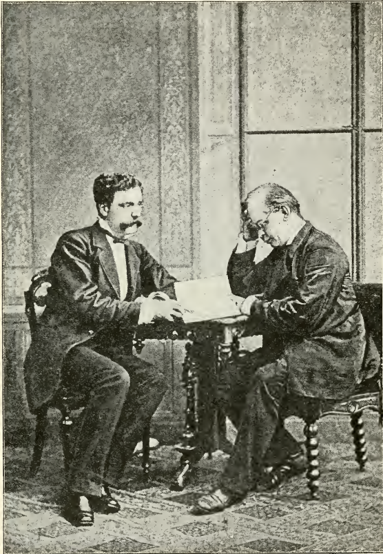
PROFESSOR ZÖLLNER AND SLADE. (From Willmann.)

Professor Fechner and bore his chair upward in a way which is not at all inexplicable by the methods of legerdemain. Professor Fechner does not mention that he hovered for some time in the air, but