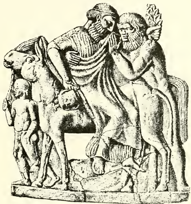
DIONYSUS ON THE ASS.

Dionysus is not himself pictured on the present bas-relief but is represented by his animals only, the steer and the ass. These two animals, which are unmistakable symbols of Dionysus worship, are standing right above the statue which is just being completed under the chisel of Prometheus. Mercury, the herald of the gods, brings down Psyche, the soul, a gift Zeus sends as his contribution to the formation of mankind, and the three Fates, Clotho, Lachesis