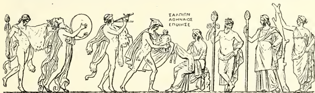
THE NATIVITY OF DIONYSUS ON A MARBLE URN IN THE MUSEUM AT NAPLES. 2

The birth of Dionysus was celebrated in Greece with great rejoicings and formed an essential part in the Bacchic mysteries. The nativity of the God who was called the saviour, the rescuer and liberator, the bringer of joy, is frequently represented in Greek art and must have been celebrated all over Greece, especially in the rural districts. The cradle of the child is always a winnowing fan (called vanus in Latin and liknon (λίκνον) in Greek) which is sacred to the God, and his