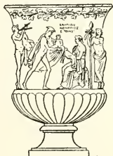
MARBLE URN IN THE MUSEUM AT NAPLES.

the former of the grape juice, the latter of the vine. While the group on the right hand is dignified and restful, the three corresponding figures on the left hand are full of Bacchantic enthusiasm. One Satyr plays the double flute and another moving in a graceful dancing step carries the thyrsus. Between them is a Bacchante beating the tympanum. The scene encircles a bell-shaped marble vase, and bears the inscription: "Salpion of Athens made it." The vessel, which belongs to the best times of the revival of the Attic school (compare Brunn, Künstlergeschichte , Vol. I, p. 599), served for a long time as a baptismal font in a church at Gaeta, and is now preserved in the museum of Naples. 1