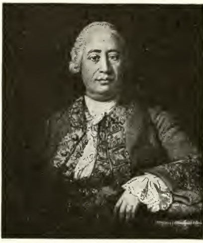
HUME. (Original 11×14 in.)

The portraits, which are 11 x 14 in., have been taken from the best sources, and are high-grade photogravures. The series is now complete.