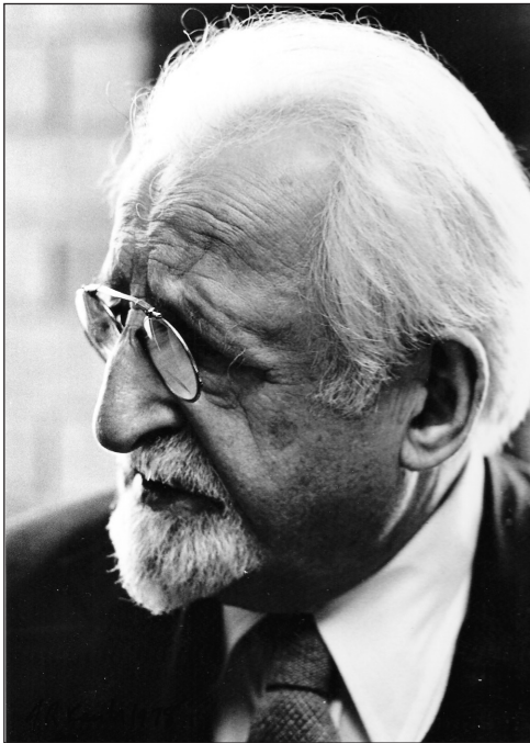
Figure 1. J. R. Kantor in 1978.

In this we see that Kantor set himself an impressive goal, one that many believe he achieved.