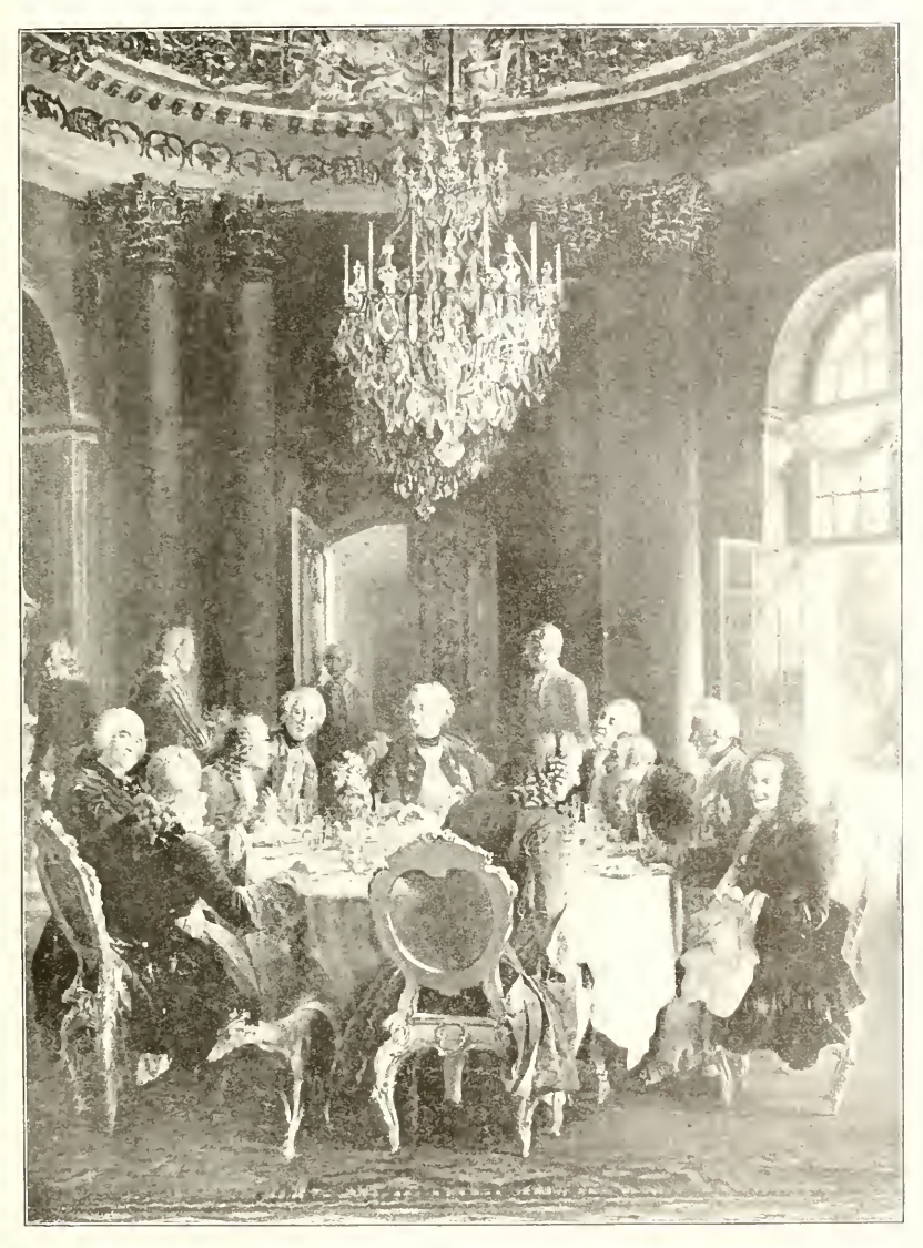
THE YOUNG KING WITH HIS GUESTS AT THE ROUND TABLE. 1 (By Adolf Menzel.)

were shaped by disciples of Wolff and Leibnitz, by the reading of Epicurus, Locke and Voltaire.