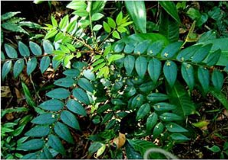
Live endemic medicinal plant Phyllanthus beddomei