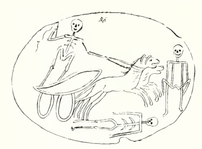
KING DEATH. GNOSTIC STONE.2

Similar ceremonies are executed by different sects in different