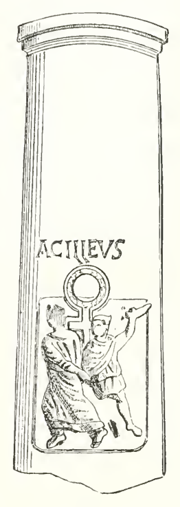
THE EGYPTIAN CROSS ON THE MARTYRDOM OF ST. ACHILLEUS. CIBORIUM COLUMN IN S. PETRO-NILLA (FOURTH CENTURY)

The Egyptian key of life has also been carried to Italy probably through the influence of Egyptian Christians. We find it for instance on a ciborium-column in S. Petronilla (discovered in 1875) in a bas-relief representing the martyrdom of St. Achilleus. Here the form of the Egyptian cross is so changed as to give to the handle the appearance of a wreath, suggesting the interpretation of a crown of life which will be the reward of the Christian martyrs who take the cross of their master upon themselves.