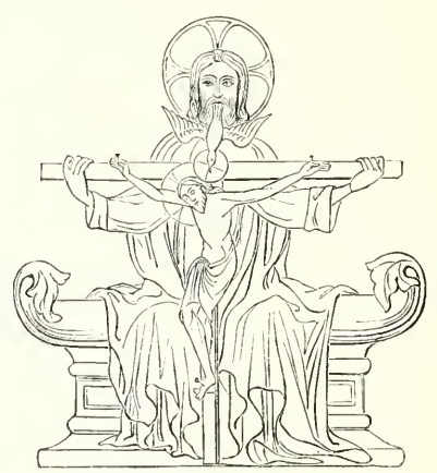
THE T Cross in a Picture of the Trinity.<sup>2</sup>

and as a T, the four-armed cross (equilateral as well as with a prolonged foot), the slanting cross, and finally the five-armed cross, which is done frequently in one and the same sentence, as though the cross of Christ might have possessed all these shapes at once. The Church-fathers at any rate rejected no analogy that could possibly be found in nature and tried all methods that could in any way indicate the mysterious powers of the cross.