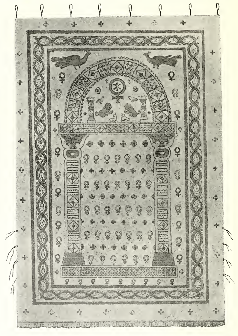
Curtain of an Early Christian Church of Egypt. (Restored by Swoboda.)

fathers. Barnabas ( Epistles , IX) mentions the number of the servants of Abraham as being three hundred and eighteen, and expresses them by the letters 1. II. T. 1=10 II=8, and T=300. Barnabas says that the number 318 (= n_1\tau or n_2\sigma r , T)