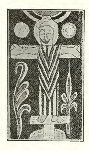
THE CRUCIFIXION ACCORDING TO THE EARLY CHRISTIANS OF EGYPT.<sup>1</sup>

In spite of the frequent references of Church fathers to the tau-form, the four-armed cross became more and more the typical symbol of Christianity, partly because people began to believe that this was the shape of Christ's cross, partly because the four-armed