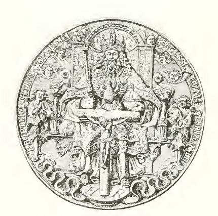
THE TAU CROSS ON THE TRINITY DOLLAR. 1

only by sacrifice for a higher purpose than self can man attain peace and solace. Many details of Paul's doctrines, his gnostic notions of the spiritual body and the arrangements as to the bodily resurrection, his prophecy of the coming of the day of the Lord during his own lifetime, and the transfiguration of the bodies of those who will be left, were at the time of great importance but faded from sight at the non-fulfilment of the prediction, leaving in the foreground and even increasing the