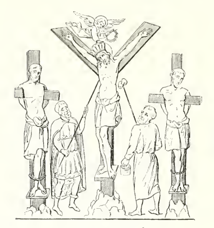
THE Y CROSS.1

St. Paul's conception of the cross is spiritual; it is the significance of Christ's death and nothing besides, but the Church-fathers descant upon the occult meaning of all kinds of forms of crosses, the simple pole, the tree, the wood, the three-armed cross as a Y