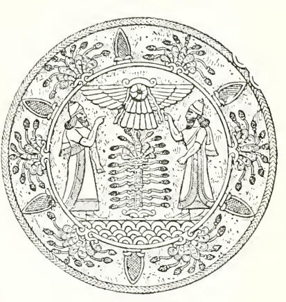
CHALDÆAN TREE OF LIFE.

Church-fathers there is no way of settling the question of what shape Christ's cross might have been. The first centuries seem upon the whole to favor the T cross, while since the age of Constantine the four-armed cross begins to be more and more While the Greek accepted. Church adopted the erect equilateral cross (+), the Latin Church finally accepted the high standing four-armed cross (+) as the symbol of the Christian faith.