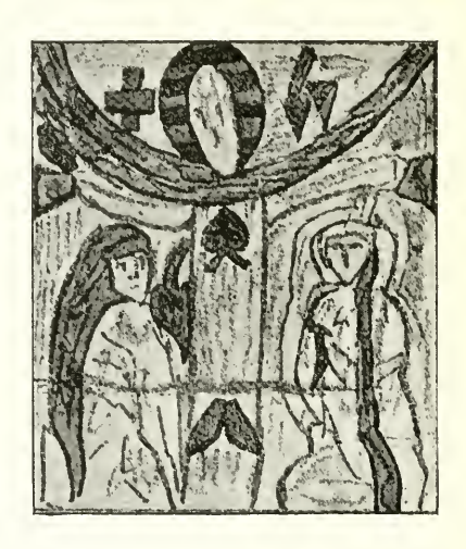
THE EGYPTIAN KEY OF LIFE CHANGES INTO A CHRISTIAN CROSS.<sup>1</sup>

cross was more pleasing to the eye and appeared more complete partly perhaps because it was more cosmopolitan, being more frequently met with in nature and admitted of more interpretations.