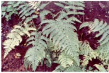
Plate - 2 Endangered ferns from the Western Ghats.