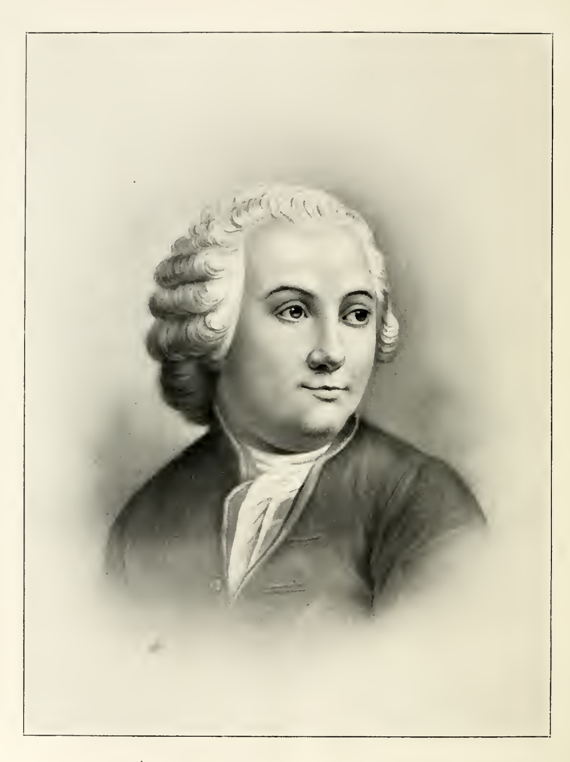
ÉTIENNE BONNOT DE CONDILLAC.

COPYRIGHT 1898 BY THE OPEN COURT PUBLISHING COMPANY, CHICAGO.