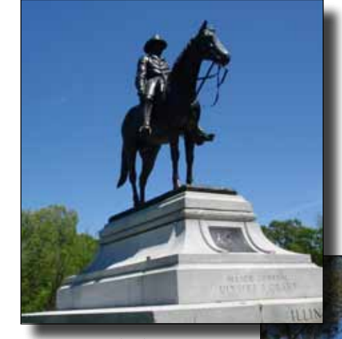
Major General Ulysses S. Grant

The Vicksburg National Military Park contains more than 1300 monuments and markers, making it one of the most decorated battlefield