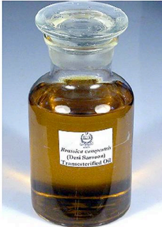
A- Brassica campestris Biodiesel