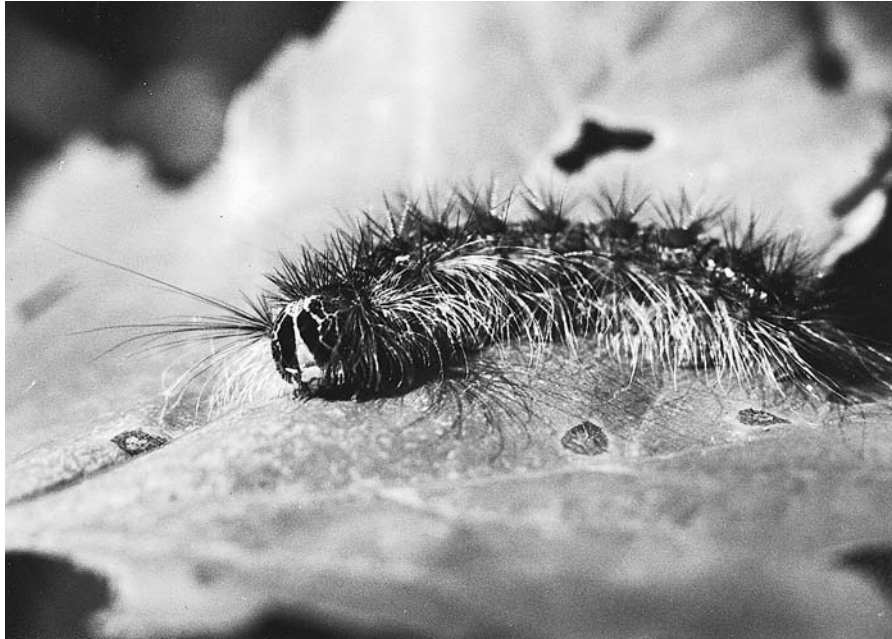
PLATE 1. Larval gypsy moth ( Lymantria dispar ). Limited larval dispersal and flightlessness of adult female gypsy moths may act in combination to allow the vulnerable pupal stage to nongenetically “inherit” areas of low predation risk, where their mothers survived to lay eggs.

parameter. Previous analytical frameworks for modeling population dynamics in heterogeneous space have typically been restricted to situations in which the environmental pattern is constant over time (Muko and Iwasa 2000, Bolker 2003, Snyder and Chesson 2003, Goodwin et al. 2005) or is redistributed completely between generations (May 1978). Although some fitness-related factors (e.g., topography) are essentially fixed, others (e.g., local weather) have little continuity over time, others may be autoregressive, and still others, like the home ranges of long-lived predators, may themselves move in space at a characteristic rate. Incorporating such a complex suite of factors on the distribution of suitability in a spatially explicit model would require many parameters, each of which is likely to be weakly supported by data. In the framework we describe here, temporal change in the spatial pattern of environmental suitability simply reduces spatiotemporal autocorrelation (especially at short distances), thereby reducing I_S^2 .