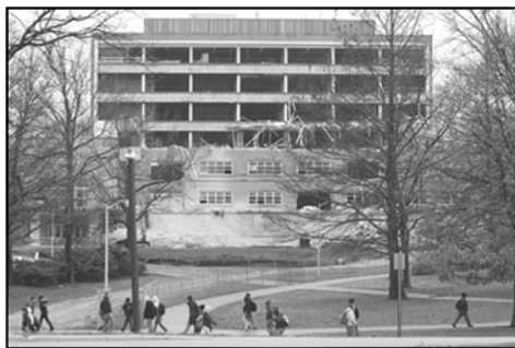
Morris Library in mid-March 2006

At a recent meeting of Library employees and representatives of the principal contractor, River City of