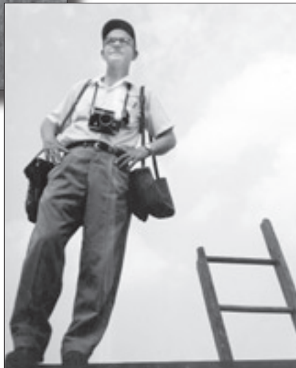
Horrell shot thousands of images of the vanishing coal mining operations in southern Illinois in the late 1960s.

Portfolio , published by SIU Press. Previously, his photographs illustrated the popular coffee table book, Land Between the Rivers: The Southern Illinois Country , published by SIU Press in 1973. Horrell died in 1989.