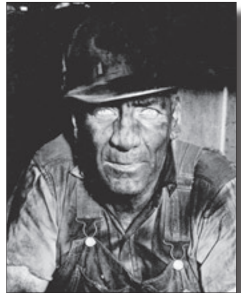
This black-faced coal miner adorns the cover of Southern Illinois Coal: A Portfolio and has become an icon of the southern Illinois coal mining industry, but his identity remains a mystery.