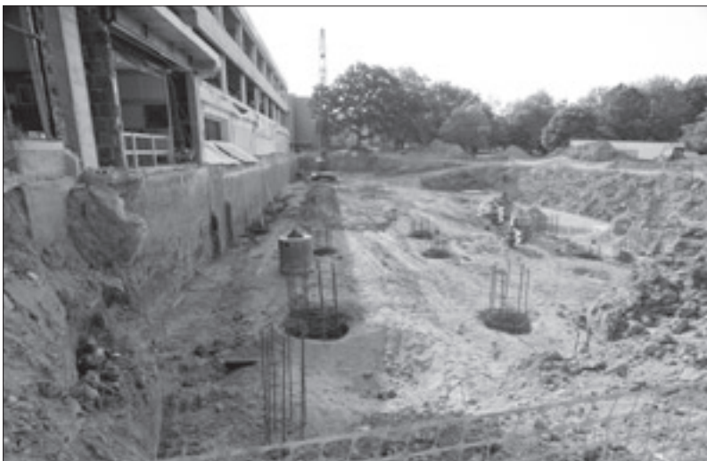
Looking west along the north face of Morris, groundwork is prepared for the building's 50,000 square foot addition. The earth is augered for caissons, the concrete pillars that will support the new structure.

Recent construction work for the Library has included the creation of the new elevator shafts and the ground excavation for the addition on the north side of the building. Rainwater problems are being addressed with the application of a new roof. Work is progressing with exterior masonry on the building's south and west sides and with siding and windows on floors 4 through 7.