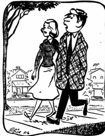
"Oh, my roommate is a nice guy — it's just that he's so dang big"