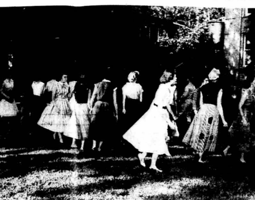
Not yet at the professional drill team level, members of the SIU Angel Flight executive... Organized several weeks ago as an auxiliary to the AFROTIC unit, the group is composed of ROTC queen candidates and members of the Salutes.