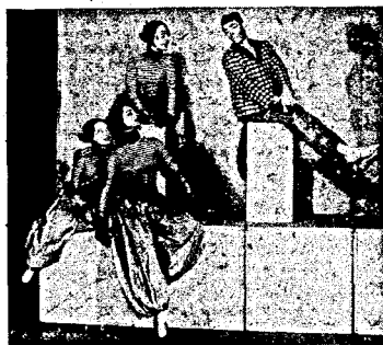
WEIDMAN DANCERS, MARCH 2