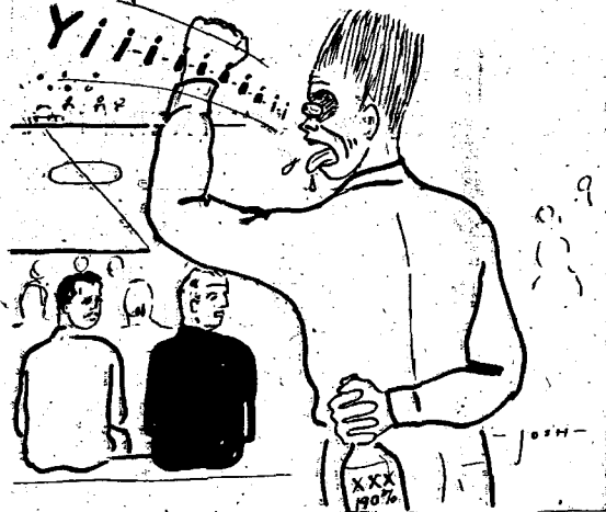
"Yes, Dr., Southern needs more students with the school spirit" of that young fellow."

"Shoe shine, mister?" "No." "I can shine 'em so you can see your face in 'em." "I said no." "Coward!" She: How about giving me a diamond bracelet? He: My dear, extenuating circumstances permit me to preclude you from such a braudle extravagance. She: I don't get it. He: That's what I said.