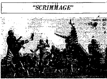
MAROONS in the heat of a fast scrimmage... Tomorrow they will pit their strength against Illinois Wesleyan at Bloomington...