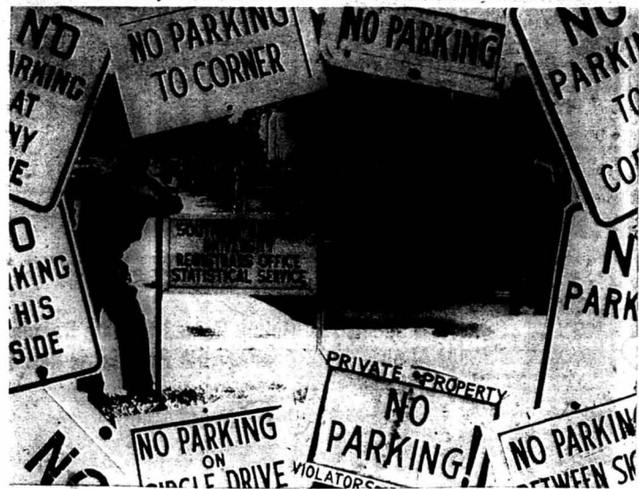
NO MORE OF THIS This feature picture, published in The Egyptian several weeks ago, shows how parking permits were obtained at that time. Effective this summer, the University has issued new parking regulations, which, when carried out over a period of the next four years, will not allow students to have autos in Carbondale.