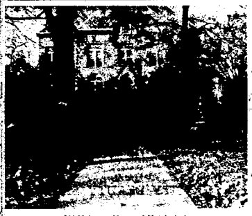
Old Main... Mecca of Matriculation