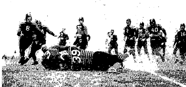
Skirmishes in the Austin Peay-Southern game here last term—two men down and twenty to go.