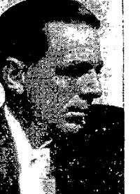
Mr. Spalding, who was born in Chicago, made his professional debut in Paris at the age of sixteen. After his debut, he made a tour of the principal cities of Europe. There is scarcely a musical center of the universe where he has not appeared, and by his masterful performances reaped once and for all the American credo that no native artist can compete with the foreign artist. He made his first professional appearance in America with the Danes orchestra in Carnegie Hall in 1908.

Albert Spalding, famous violinist, presented a program in Shryock Auditorium last night to an enthusiastic audience. This was the first of the series of concerts presented each year by the Carbonade Cooperative Concert Association.